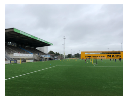
KVV THES SPORT VZW Tessenderlo, Belgium

www.greenfields.eu E: info@greenfields.eu T: +31 (0)548 633 333