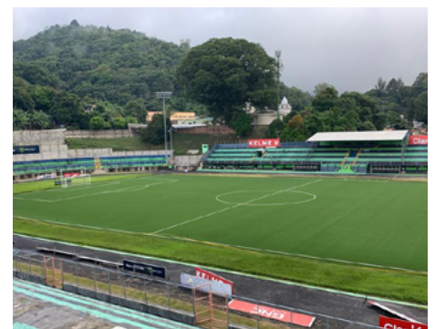
ESTADIO LAS DELICIAS Las Delicias, San Salvador

www.greenfields.eu E: info@greenfields.eu T: +31 (0)548 633 333