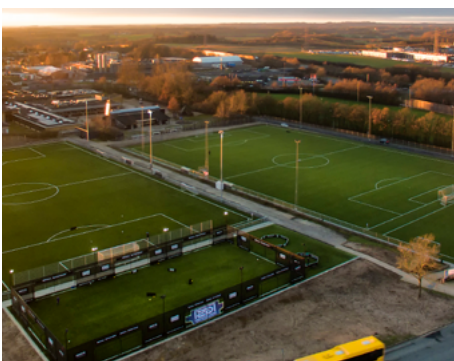
KOLDINGQ - FYNISKE ARENA Odense, Denmark