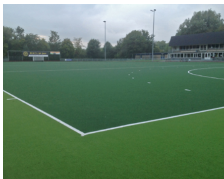
MHC LEEUWARDEN Leeuwarden, Netherlands

www.greenfields.eu E: info@greenfields.eu T: +31 (0)548 633 333