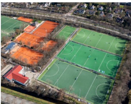
LOHC OEGSTGEEST Oegstgeest, Netherlands